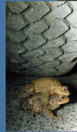
Fig. 1: Transportation infrastructure act as barriers to the movement of many animals. Amphibians are among the species that are strongly affected by traffic mortality.