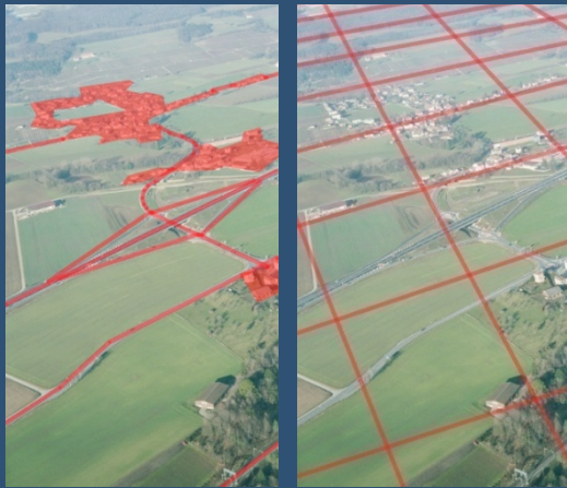
Fig. 2: Landscape fragmentation caused by roads and settlements. The fragmenting elements (shown in red) act as barriers and as sources of disturbance (left). At the right, the corresponding effective mesh size is shown as a regular network (from Jaeger et al. 2007). The effective mesh size corresponds with the size of the rectangles.